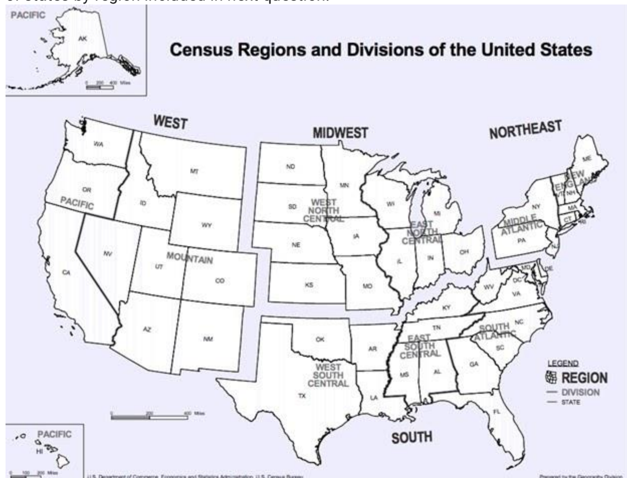
Image Description: Map of US Census Regions and Divisions of the United States. List of states by region included in next question.

Using the above map or below descriptions as reference, which US region are you located in?